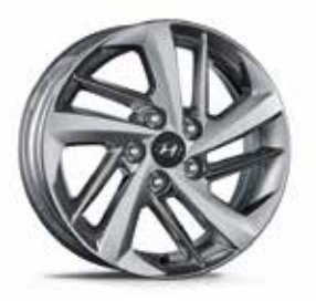
Alloy wheel 16" (52910D7120PAC)