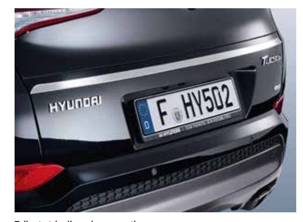
Tailgate trim line, chrome optic