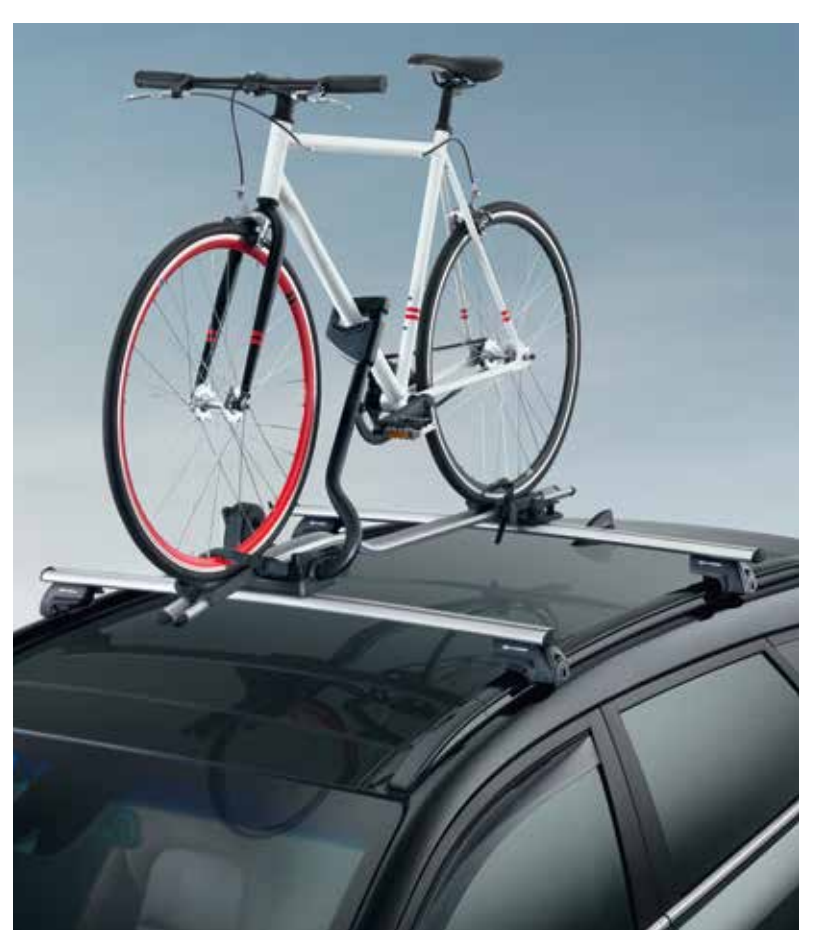
Bike carrier Pro