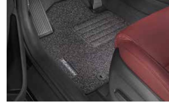
Textile floor mats, standard