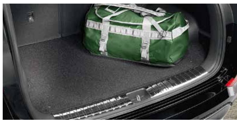
Trunk mat, reversible

Dual function trunk mat that is made specifically for the Tucson. On one side there is the soft cushioning of high-quality velour for sensitive cargo, and a resilient dirt resistant surface for potentially messy loads on the reverse. Can be combined with the foldout bumper flap to protect the surface of the rear bumper. D7120ADE00