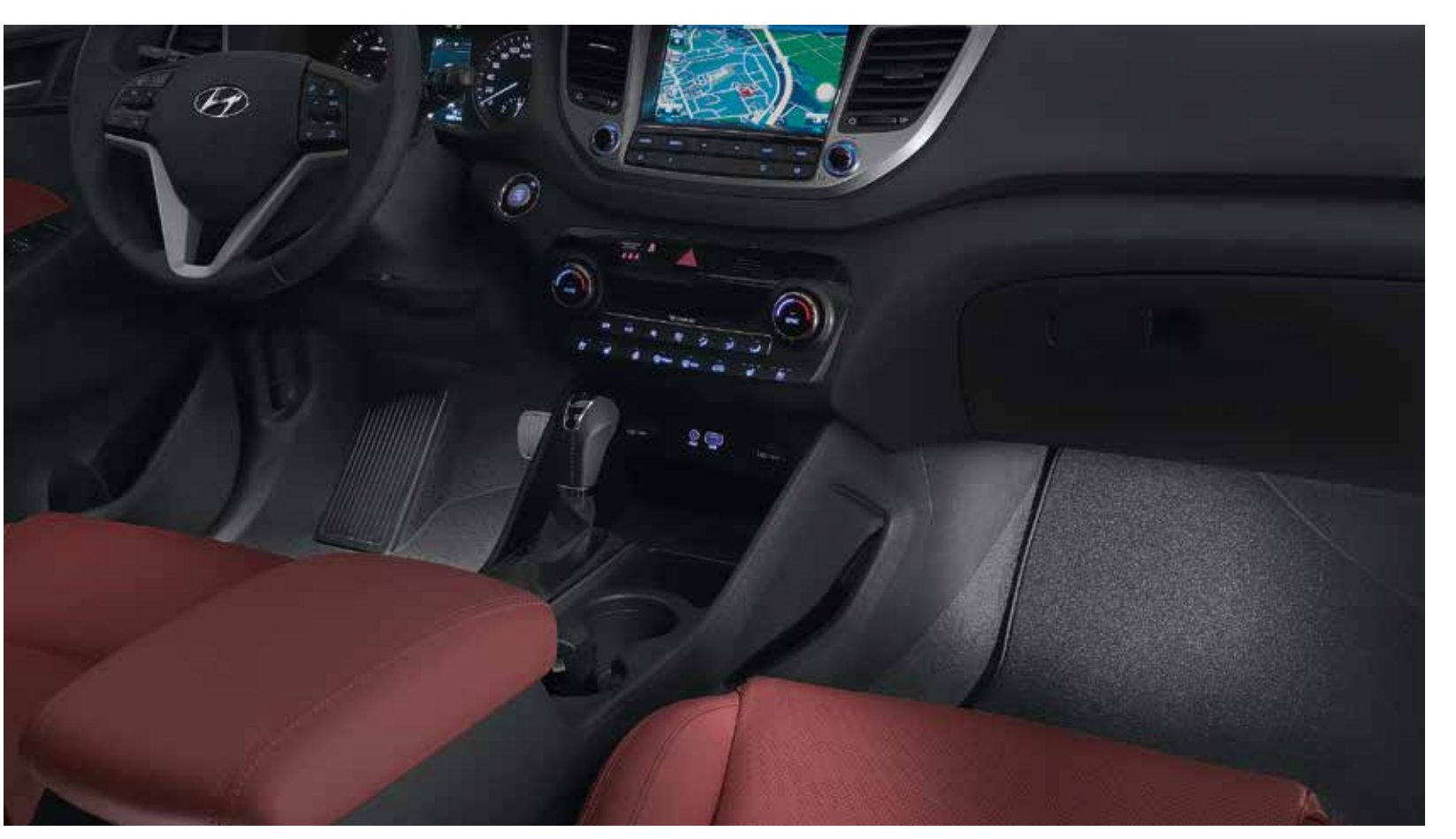
LED footwell illumination, white, first row

99650ADE20W (white, 1st row) 99650ADE30W (white, 2nd row) 99650ADE20 (blue, 1st row) 99650ADE30 (blue, 2nd row) 2nd row only in combination with 1st row LED lighting.