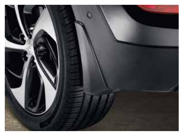
Mud guard kit, rear