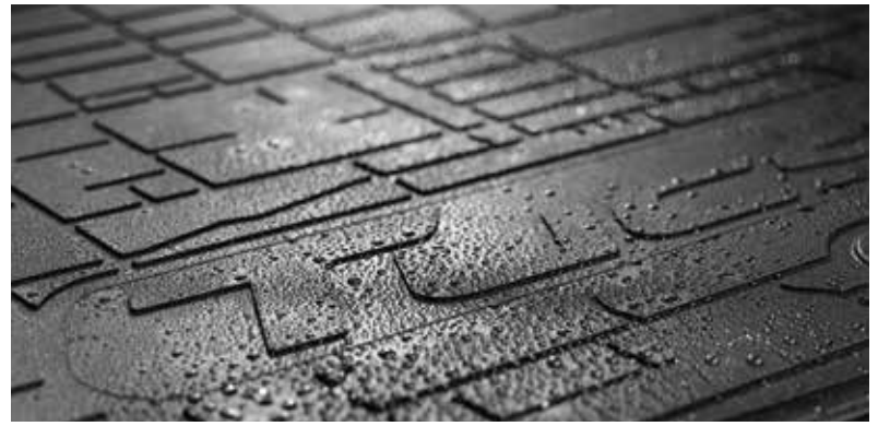
Trunk liner (close-up)