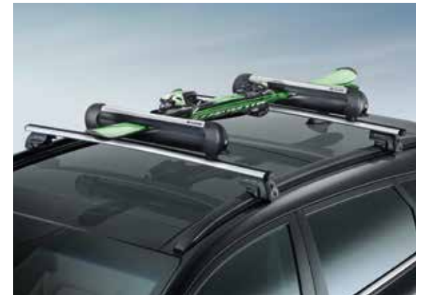
Ski & snowboard carrier 400

Whatever the reason, whatever the season: when you require additional storage for your Tucson, this roof box gives you both quality and quantity. Aerodynamic and sleek, easy to install and robust, it also features dual side opening for fast loading and unloading. Lockable for theft prevention. Roof box capacity: 75 kg. Please always check the maximum roof load of your vehicle. 99730ADE00 (dimensions: 195x73.8x36cm/390L)