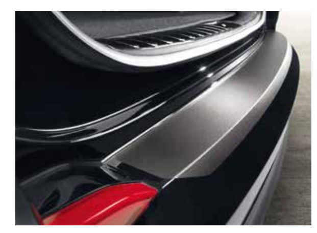
Rear bumper protection foil, black