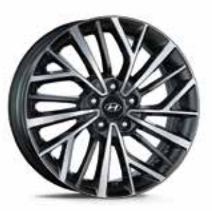
Alloy wheel 18" (52910D7370PAC)

Protect your style investment with this set of 4 locking wheel nuts. 99490ADE50 (medium nuts)