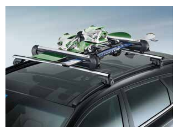
Ski & snowboard carrier 600