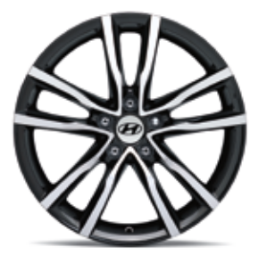
Alloy wheel 18" Ulsan (D7400ADE02)