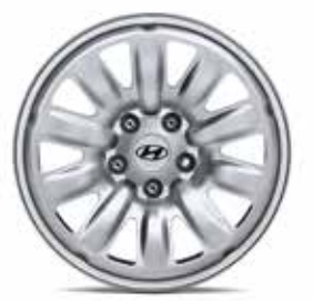
Steel wheel 17" (D7401ADE00)