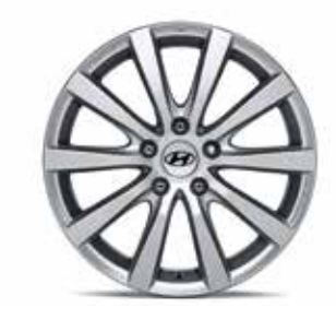
Alloy wheel 17" Halla (A4400ADE01)