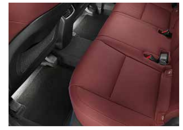
LED footwell illumination, white, second row

LED footwell illumination, blue, first row