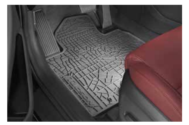
All weather mats

Set of 4 fitted mats that protect the interior from the effects of water, mud and dirt. A Tucson city map and Tucson logo are moulded into the top surface of these durable mats. Matching trunk liner is also available. D7131ADE01 (LHD/MY 16) D7131ADE50 (LHD/MY 19) D7131ADE10 (RHD/MY 16/not shown) D7131ADE60 (RHD/MY 19/not shown)