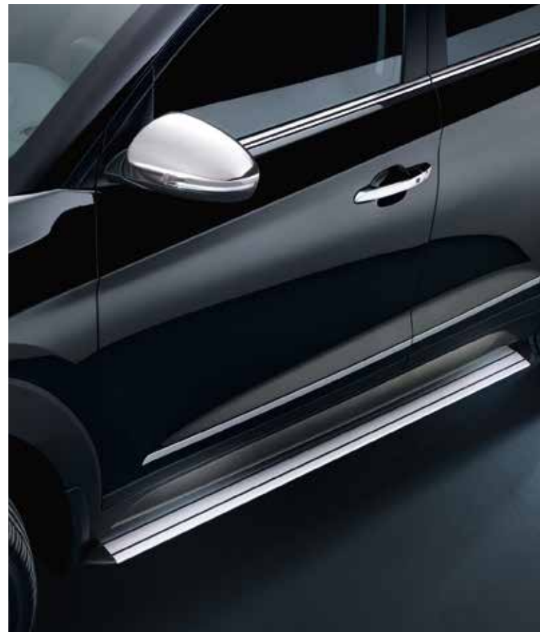
Door mirror caps, chrome optic