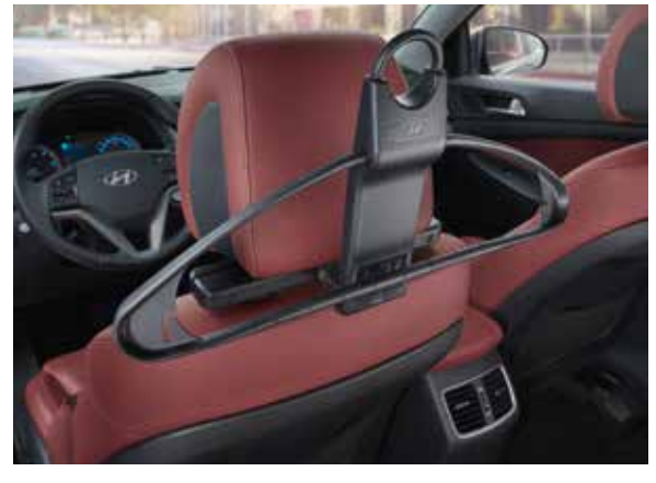
Business suit hanger

These Genuine accessories have been developed to make every journey as pleasant as possible for you and your passengers, whatever the weather.