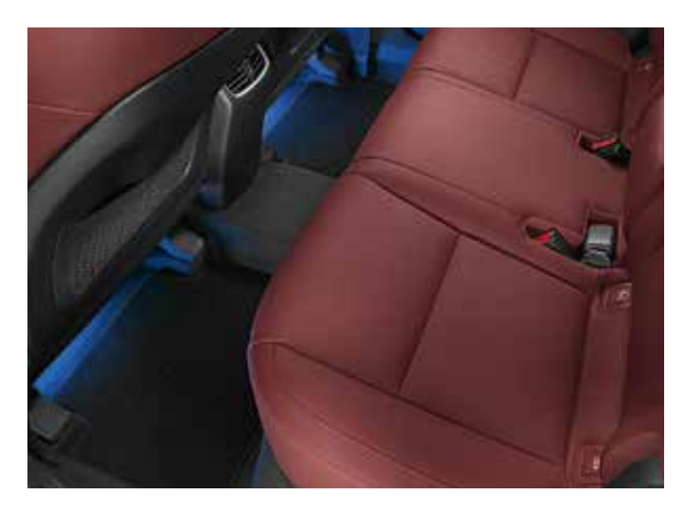
LED footwell illumination, blue, second row