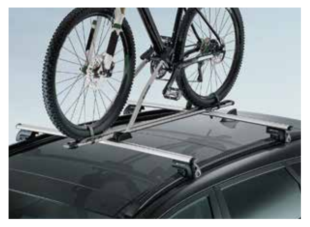
Bike carrier Active