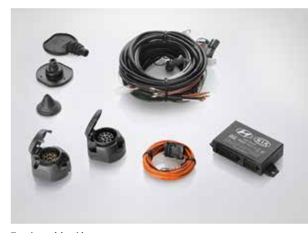
Tow bar wiring kit