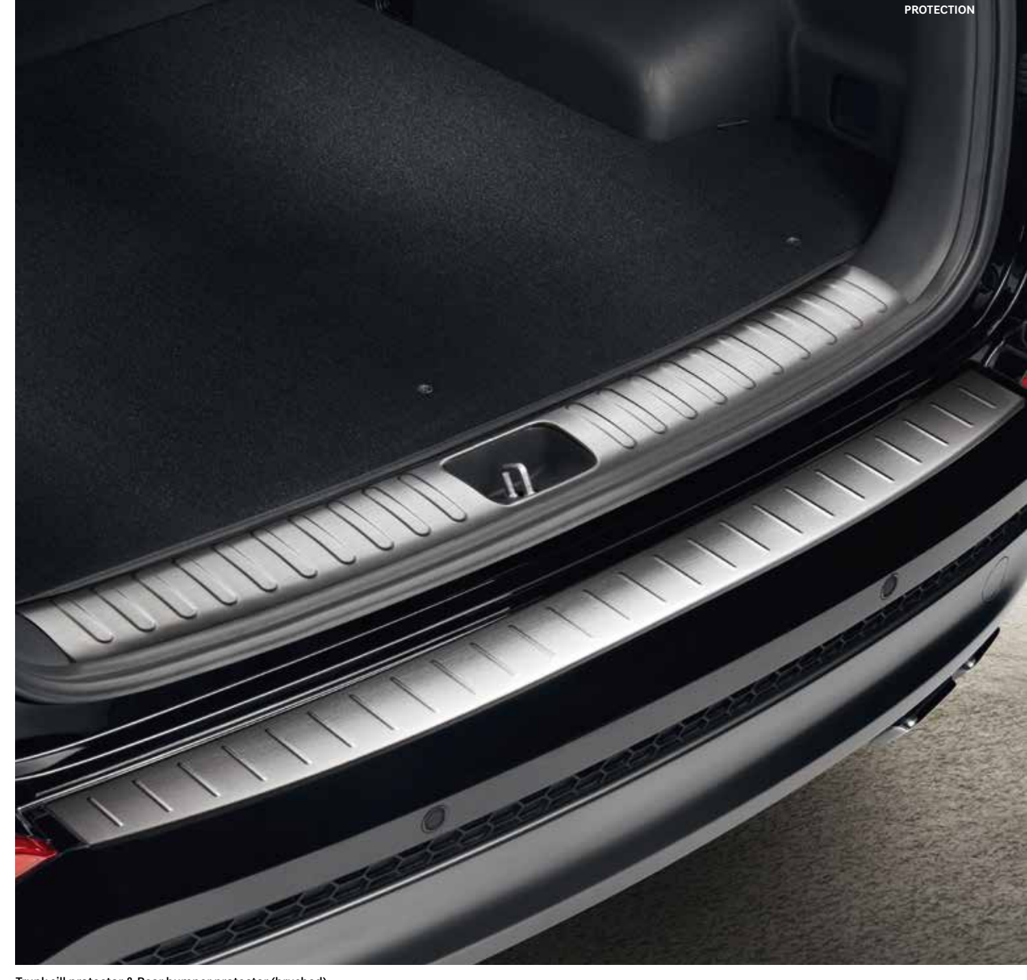
Trunk sill protector & Rear bumper protector (brushed)