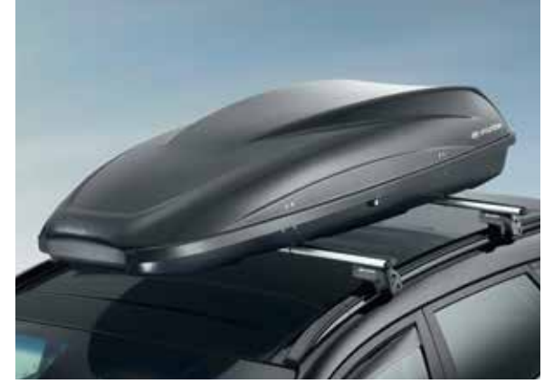
Roof box 390