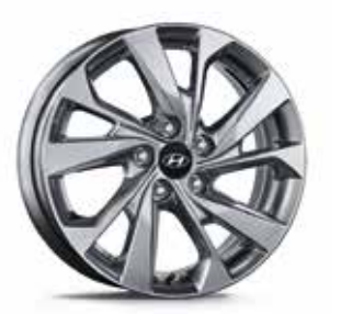
Alloy wheel 17" (52910D7220PAC)