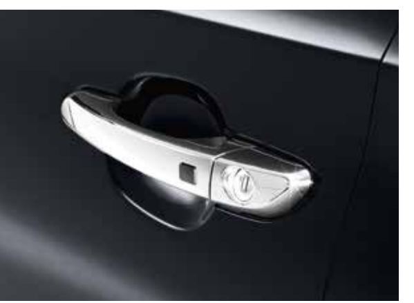
Door handle recess protection foils