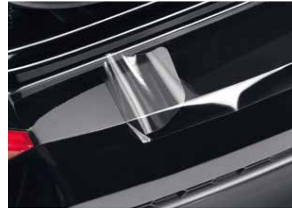
Rear bumper protection foil, transparent