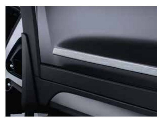
Side trim lines, brushed