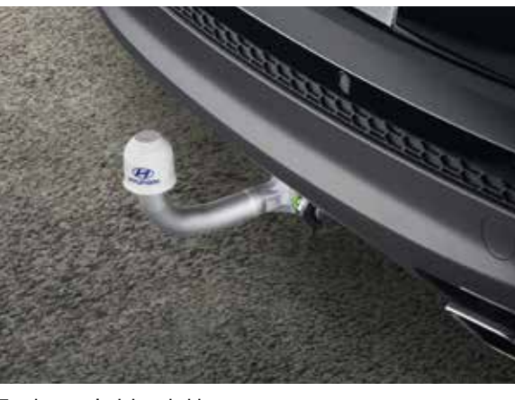
Tow bar, vertical detachable