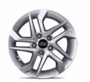
Alloy wheel 16" (52910D7110PAC)