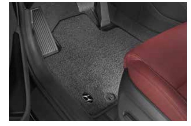
Textile floor mats, premium

Tailor-made to fit the foot-wells perfectly, these luxurious thick velour mats are held in place with standard fixing points and anti-slip backing. Set of 4, the front mats are embellished with a tasteful black and silver metal cast Hyundai logo. D7144ADE00 (LHD/MY 16) D7144ADE10 (RHD/MY 16/not shown)