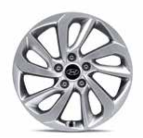
Alloy wheel 17" (52910D7210PAC)