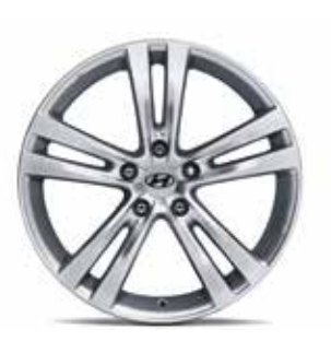
Alloy wheel 18" Busan (A4400ADE02)