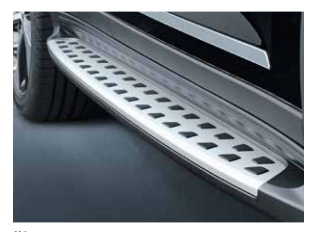
Side steps, sporty