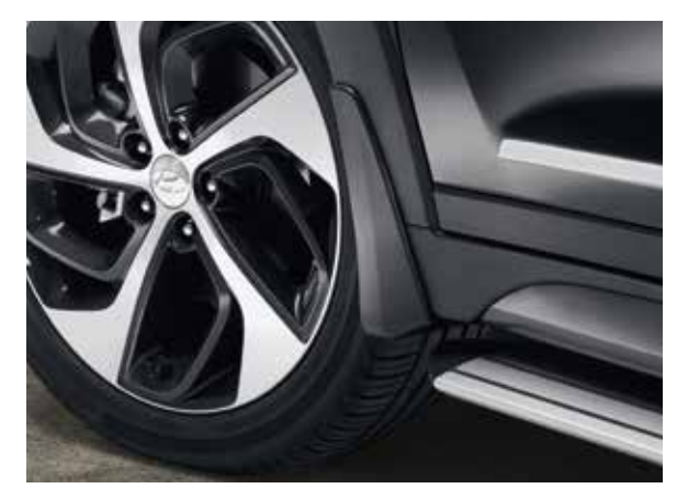
Mud guard kit, front