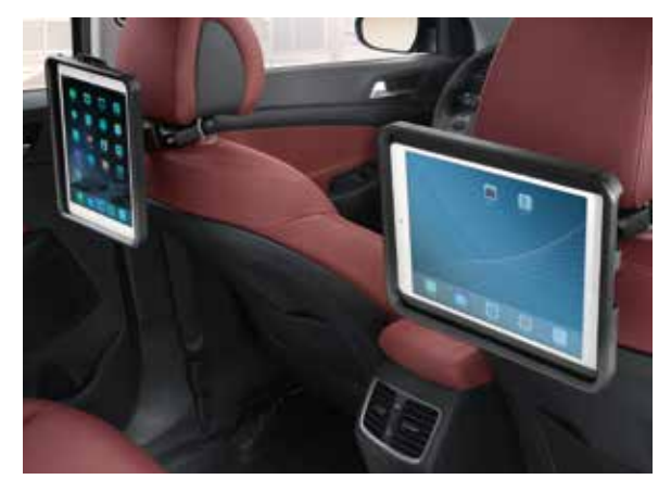
Rear seat entertainment cradle for iPad®